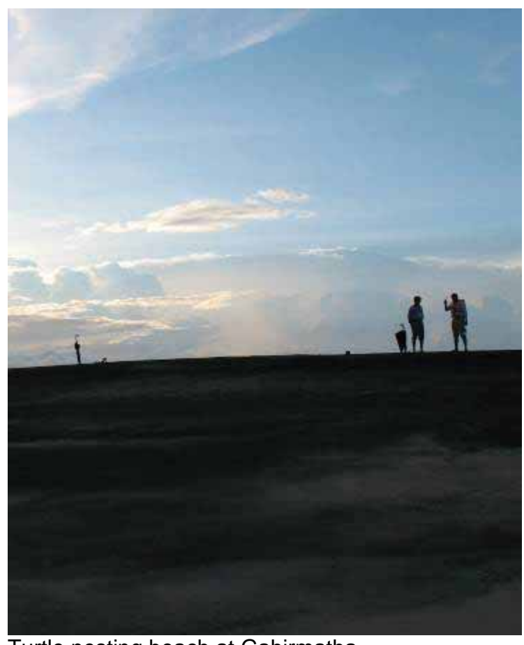
Turtle nesting beach at Gahirmatha